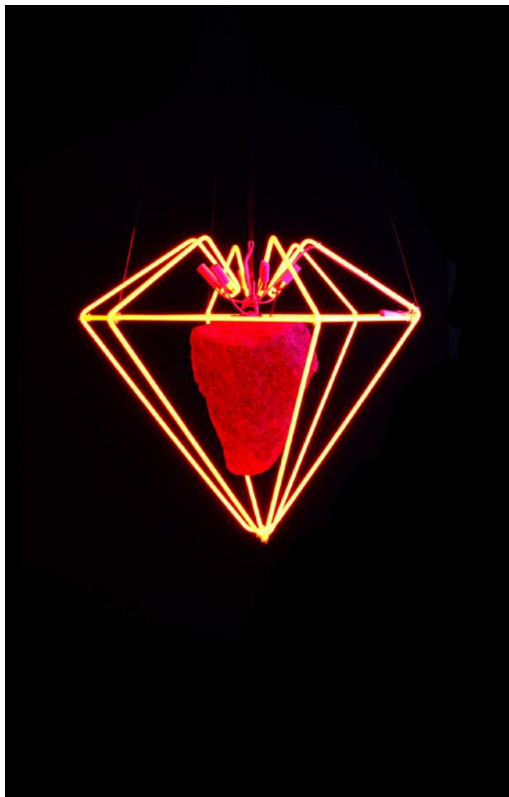
Zhou Wendou , b. 1970 Diamond Dreams 3 - Red 2010 Neon light, resin rock 85 x 85 x 80 cm 60,000 RMB