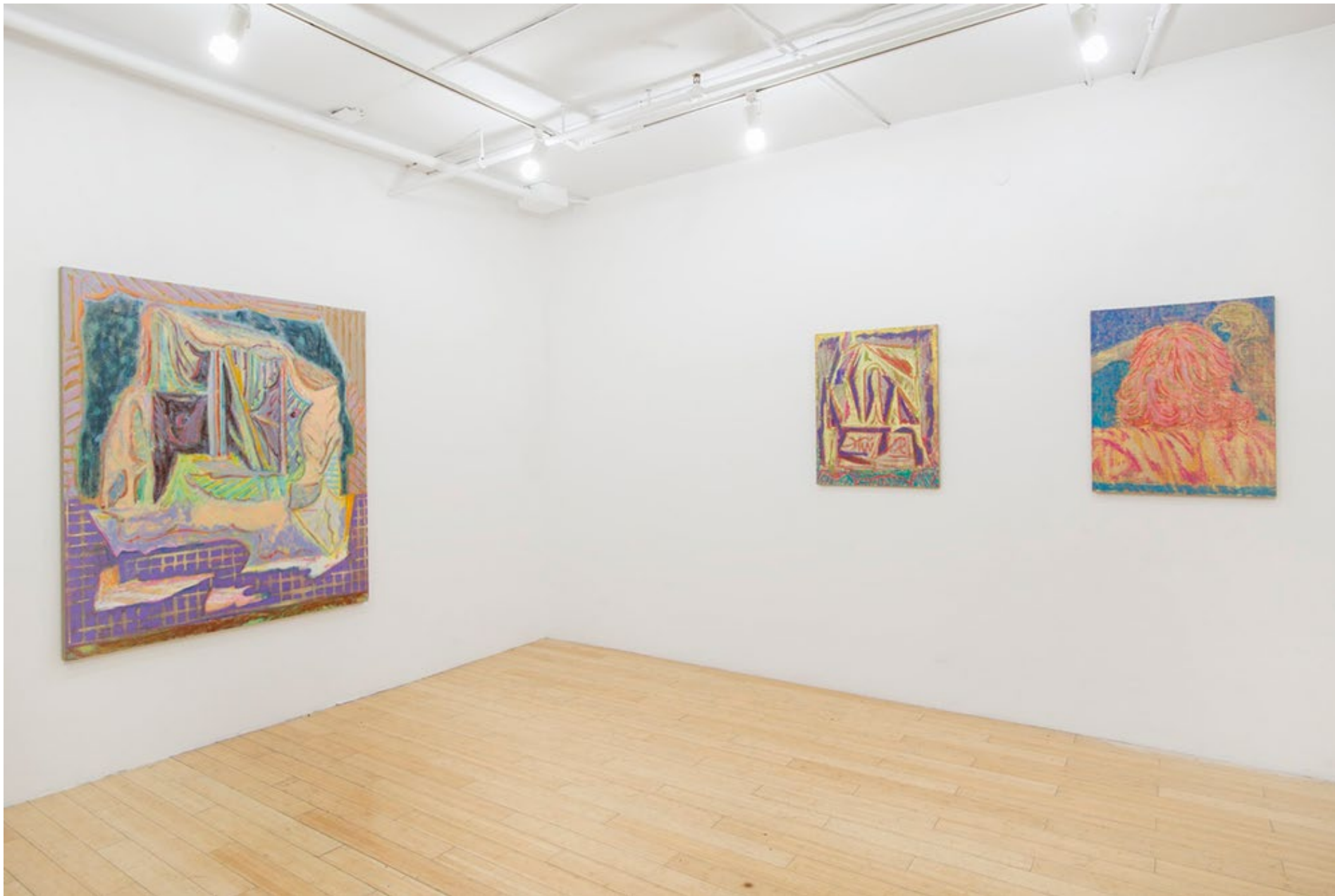
Solo exhibition view, Beggars Blanket , 2014 Kansas Gallery, New York