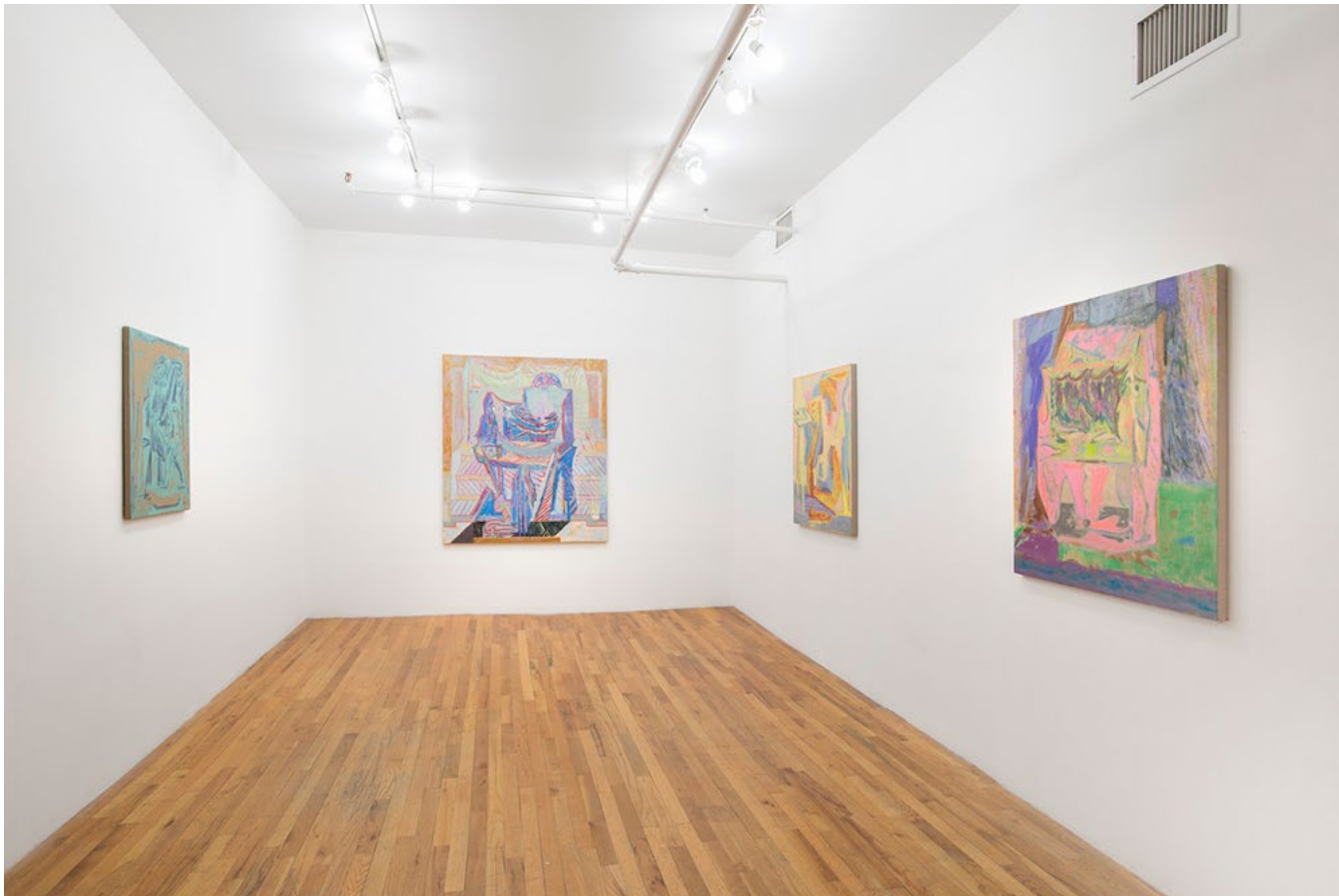
Solo exhibition view, Beggars Blanket , 2014 Kansas Gallery, New York