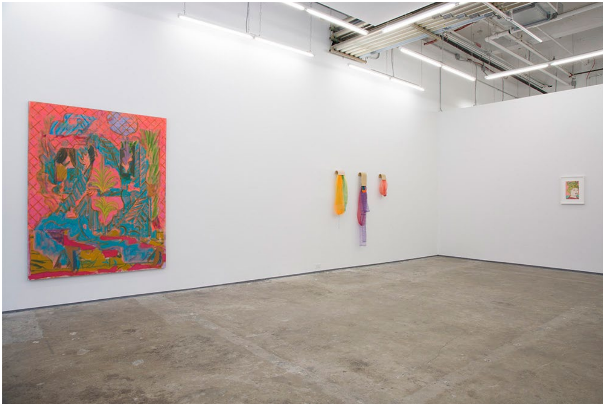
Exhibition view, Jack and Diane , 2016 Kate Werble Gallery, New York