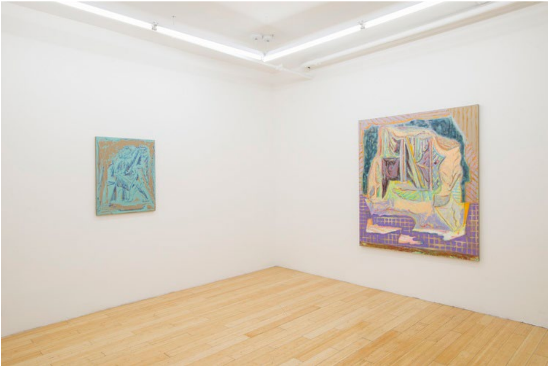
Solo exhibition view, Beggars Blanket , 2014 Kansas Gallery, New York