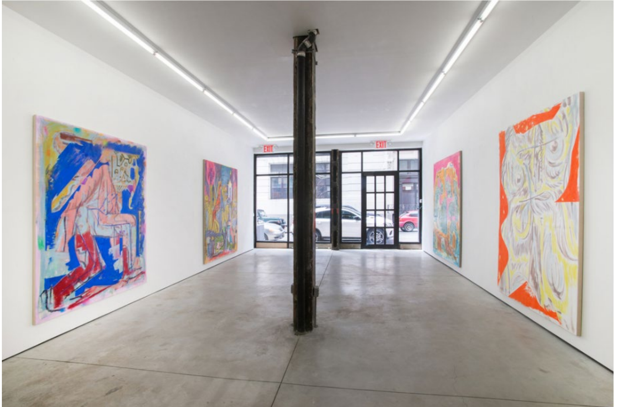
Solo exhibition view, Something of a Feather , 2016 Kansas Gallery, New York, NY