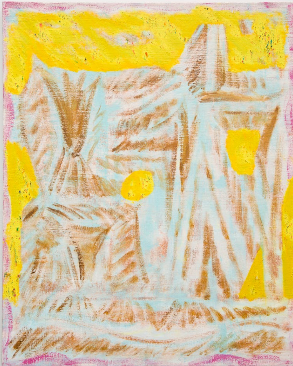
Michael Berryhill Ornmint , 2015 Oil on linen 30 x 24 inches KWG-BERR-021