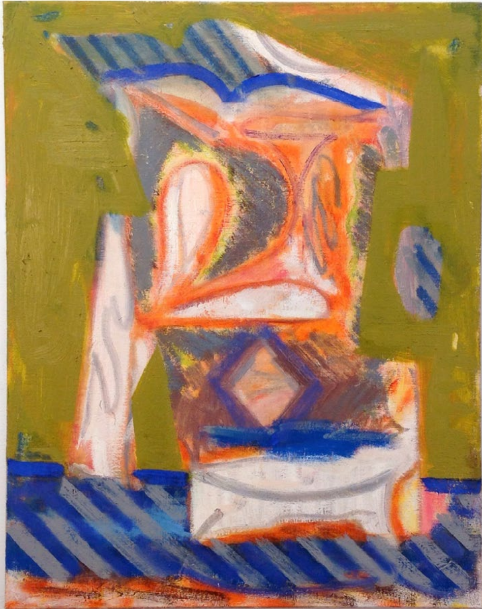
Michael Berryhill Diamond Level , 2015 Oil on linen 28 x 22 inches KWG-BERR-031