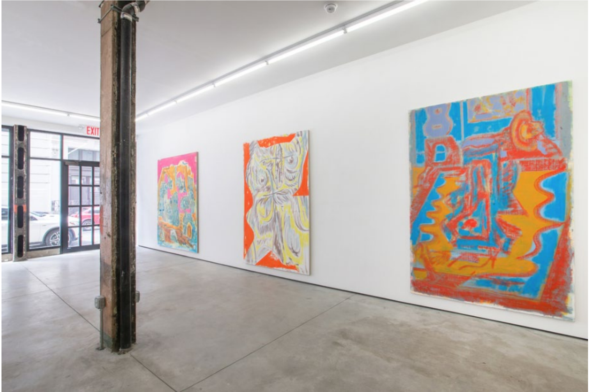
Exhibition view, Something of a Feather , 2016 Kansas Gallery, New York, NY