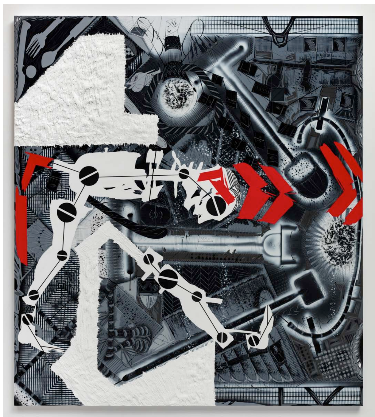
LARI PITTMAN 243.8 X 218.4 X 4.4 CM

Artist | Lari Pittman Title | Grisaille, Ethics & Knots (painting with cataplasm #2) Medium I oil, cel vinyl, spray lacquer over gessoed canvas over wood panel Year | 2016