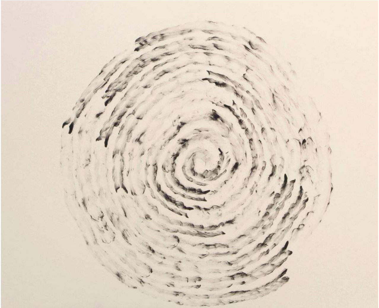
William Mackrell Round and Around, 2016 Lipstick on paper, 110 x 90 cm

GALERIE KRINZINGER · SEILERSTÄTTE 16 · 1010 WIEN TEL +43 1 513 30 06 FAX +43 1 513 30 06 33 galeriekrinzinger@chello.at