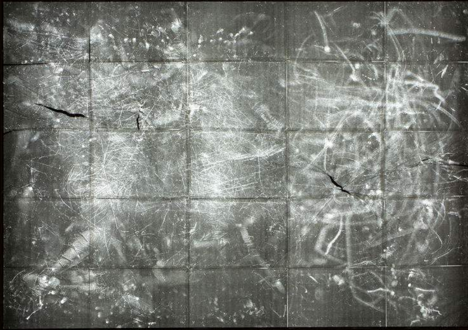
William Mackrell Sleep (Negative), 2013 action on carbon paper and light installation, 140 x 200 cm

GALERIE KRINZINGER · SEILERSTÄTTE 16 · 1010 WIEN TEL +43 1 513 30 06 FAX +43 1 513 30 06 33 galeriekrinzinger@chello.at