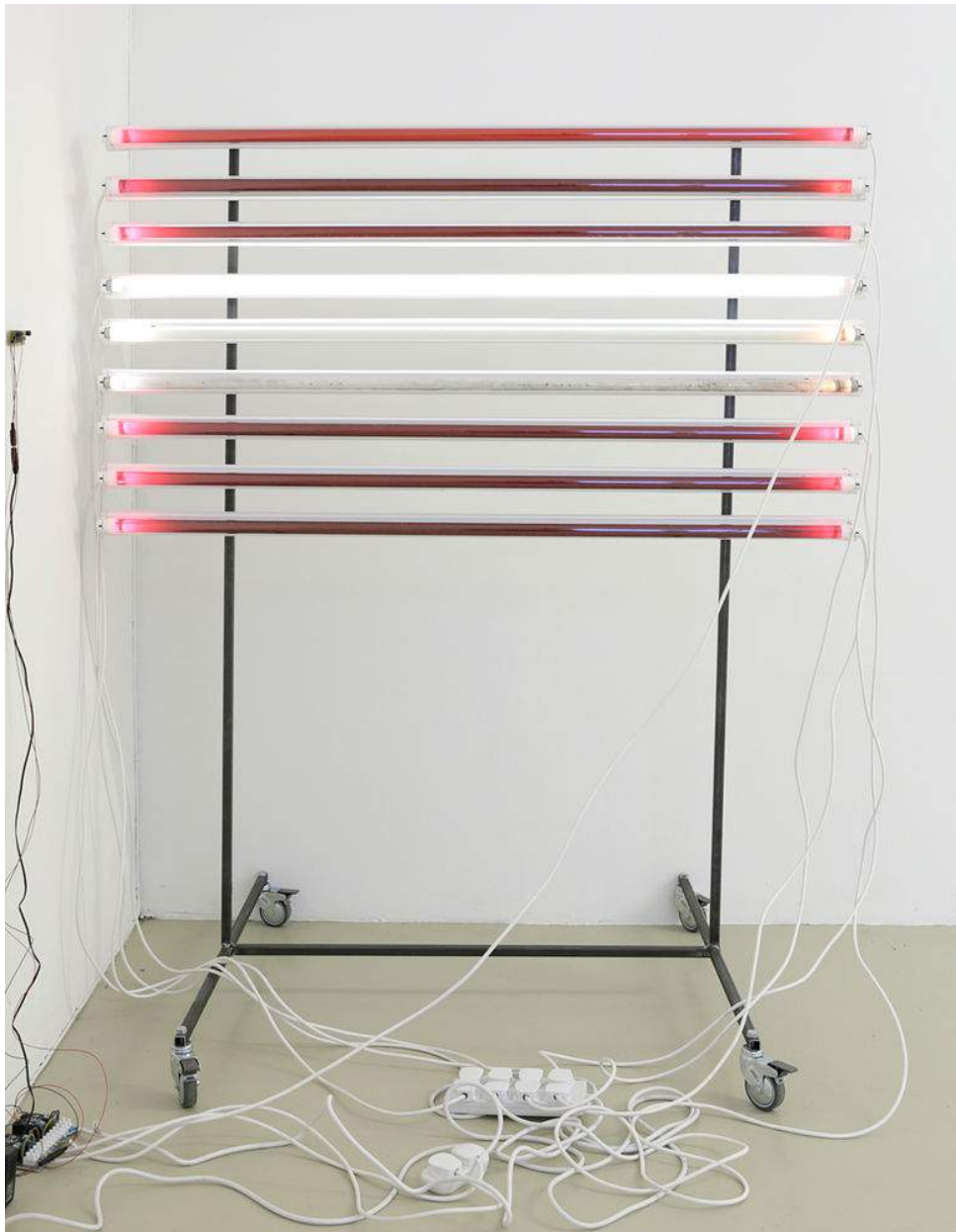
William Mackrell December 4th, 2016 neon and steel structure, 160 x 100 cm

GALERIE KRINZINGER · SEILERSTÄTTE 16 · 1010 WIEN TEL +43 1 513 30 06 FAX +43 1 513 30 06 33 galeriekrinzinger@chello.at