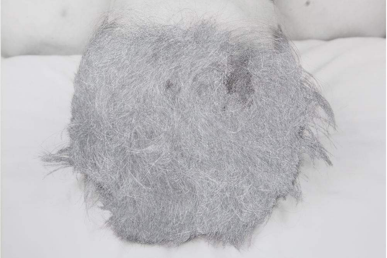
William Mackrell Top of my head (Supersize), 2015 c-print, etching on aluminium, 114 x 176 cm

GALERIE KRINZINGER · SEILERSTÄTTE 16 · 1010 WIEN TEL +43 1 513 30 06 FAX +43 1 513 30 06 33 galeriekrinzinger@chello.at