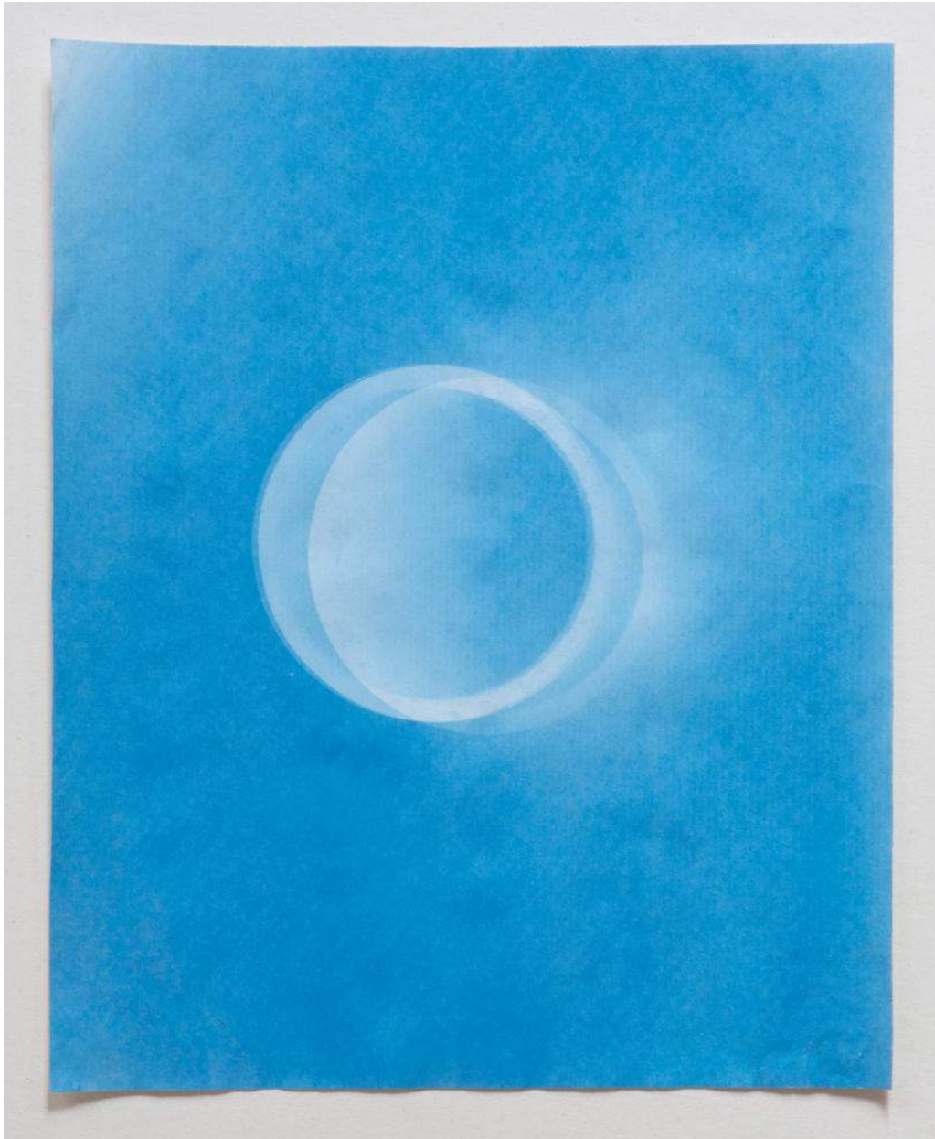
William Mackrell Moving on, 2013 Cyanotype 25 x 20 cm

GALERIE KRINZINGER · SEILERSTÄTTE 16 · 1010 WIEN TEL +43 1 513 30 06 FAX +43 1 513 30 06 33 galeriekrinzinger@chello.at