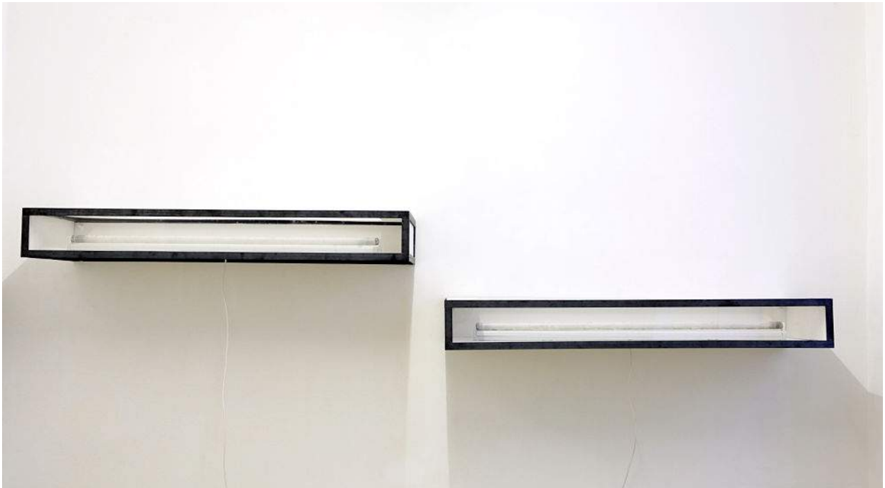
William Mackrell Interruption, 2017 dimensions variable

GALERIE KRINZINGER · SEILERSTÄTTE 16 · 1010 WIEN TEL +43 1 513 30 06 FAX +43 1 513 30 06 33 galeriekrinzinger@chello.at