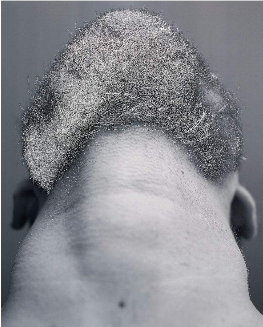
William Mackrell Gulp (Supersize), 2016 c-print, etching on aluminium, 209 x 169 cm

GALERIE KRINZINGER · SEILERSTÄTTE 16 · 1010 WIEN TEL +43 1 513 30 06 FAX +43 1 513 30 06 33 galeriekrinzinger@chello.at