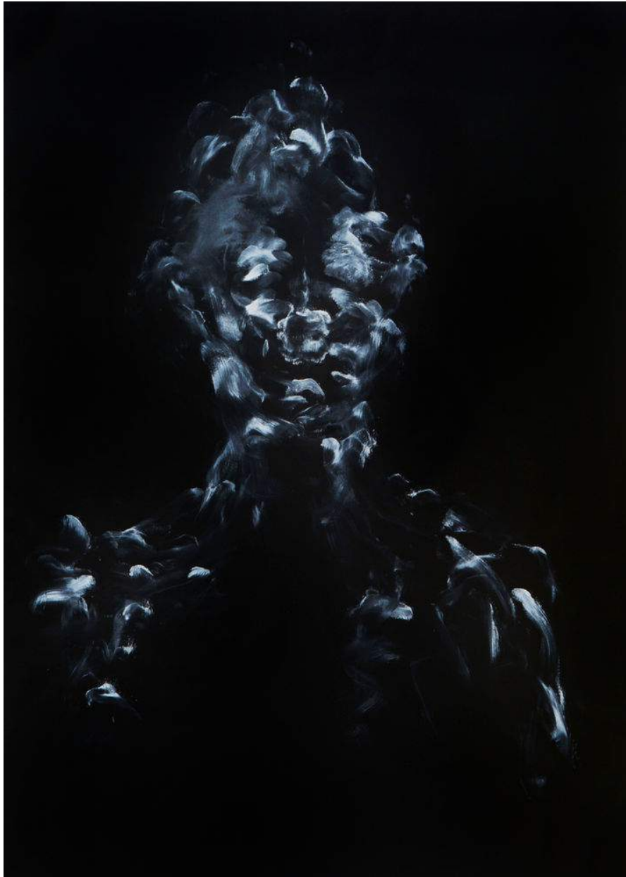
William Mackrell Self (white on black), 2016 Lipstick on paper, 70 x 50 cm

GALERIE KRINZINGER · SEILERSTÄTTE 16 · 1010 WIEN TEL +43 1 513 30 06 FAX +43 1 513 30 06 33 galeriekrinzinger@chello.at