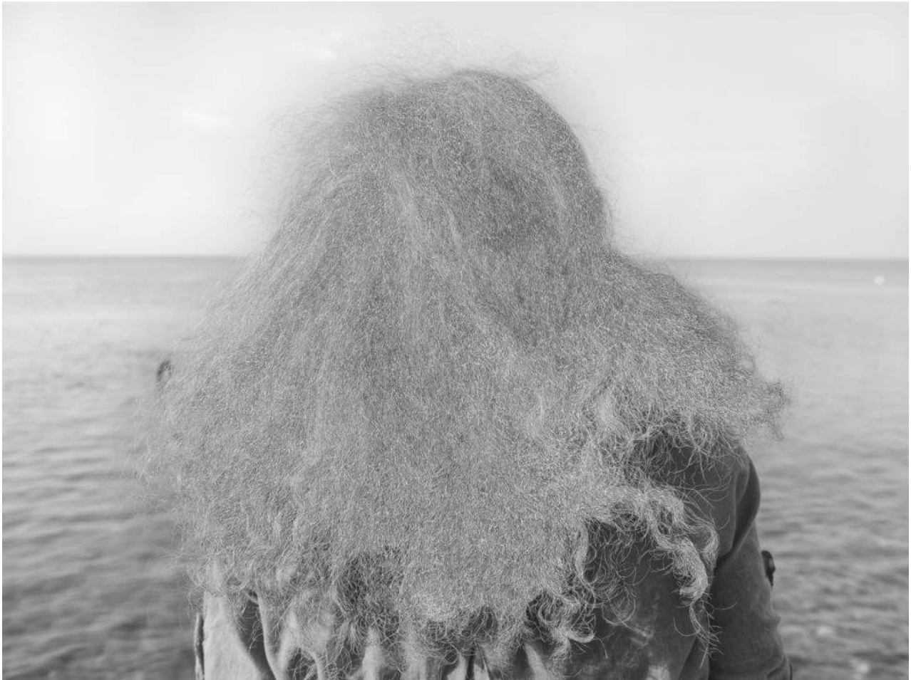
William Mackrell Back of Lucia's head, 2015 c-print, etching on aluminium, 90 x 120 cm

GALERIE KRINZINGER · SEILERSTÄTTE 16 · 1010 WIEN TEL +43 1 513 30 06 FAX +43 1 513 30 06 33 galeriekrinzinger@chello.at