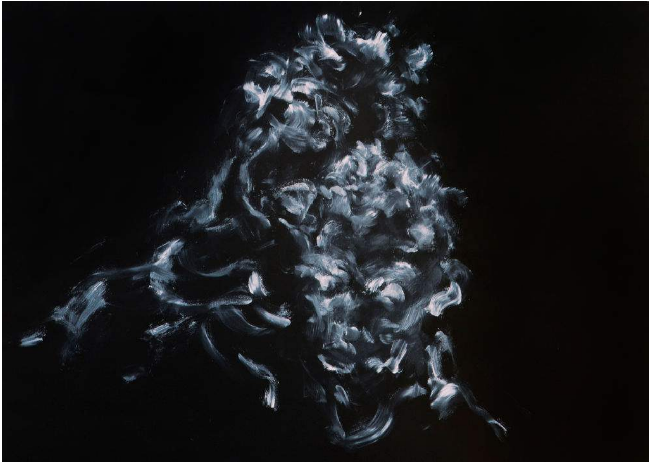
William Mackrell Self help self (white on black), 2016 Lipstick on paper, 50 x 70 cm

GALERIE KRINZINGER · SEILERSTÄTTE 16 · 1010 WIEN TEL +43 1 513 30 06 FAX +43 1 513 30 06 33 galeriekrinzinger@chello.at