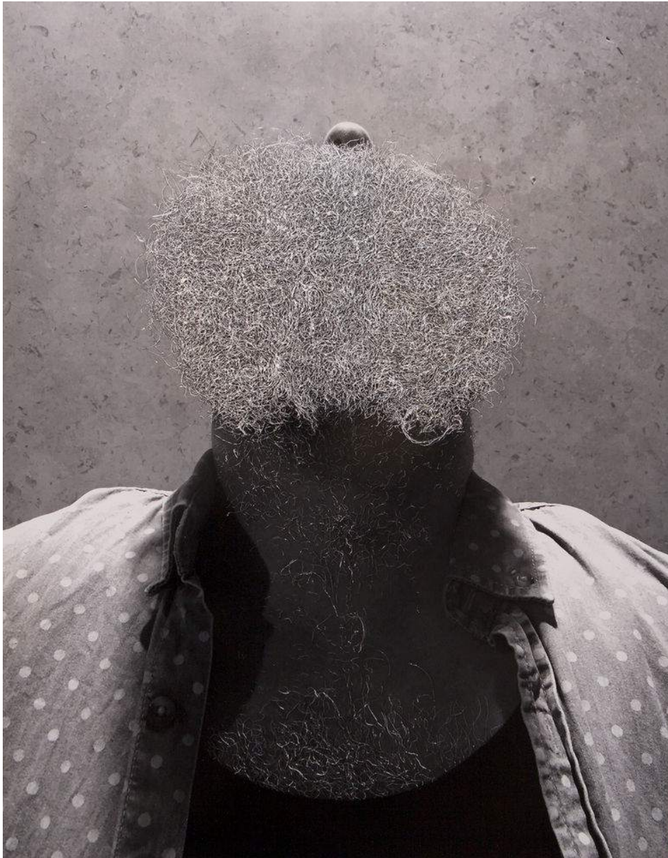
William Mackrell Plume, 2016 c-print, etching on aluminium, 37 x 30 cm

GALERIE KRINZINGER · SEILERSTÄTTE 16 · 1010 WIEN TEL +43 1 513 30 06 FAX +43 1 513 30 06 33 galeriekrinzinger@chello.at