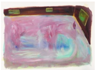
CHENG Ting Ting Exhibition Hall 展廳, 2016 Acrylic on paper 50 x 66 cm, 55 x 72 cm framed