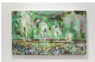
CHENG Ting Ting Fountain Steps 噴泉階梯, 2016 Oil on canvas 70 x 120 cm