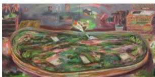
CHENG Ting Ting Starfish Studio, 2016 oil on canvas 120 x 240 cm