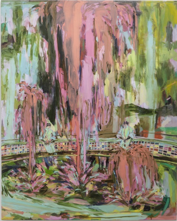
CHENG TING TING Grand Fountain 大噴泉, 2016