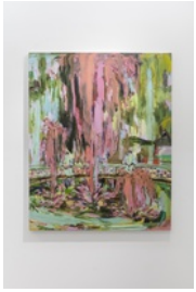
CHENG Ting Ting Grand Fountain 大噴泉, 2016 Oil on canvas 150 x 120 cm