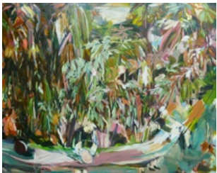
CHENG Ting Ting Along The Lane: Section S, 2015 oil on canvas 150 x 120 cm