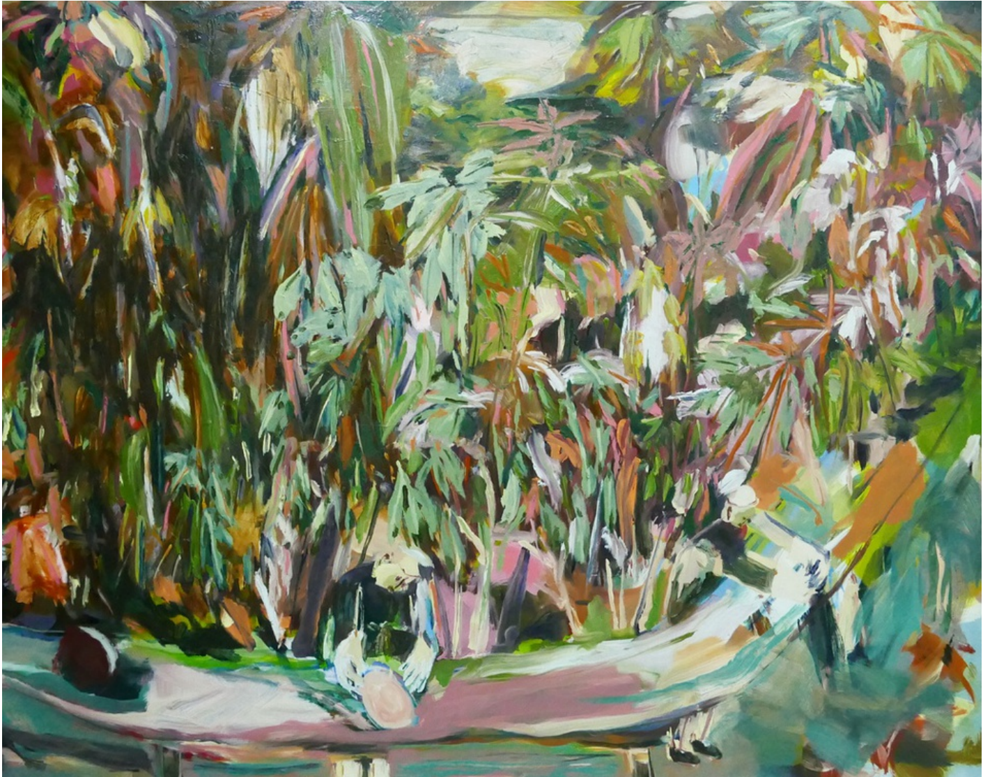
oil on canvas 150 x 120 cm

Exhibitions The Imaginary Order_15/1-5/3/2016_Gallery EXIT