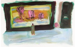
CHENG Ting Ting Entrance Hall 門廳, 2016 Acrylic on paper 37 x 56 cm, 42 x 60 cm framed