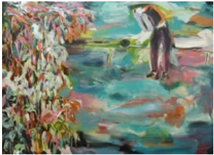
CHENG Ting Ting Along The Lane: Section P, 2015 oil on canvas 160 x 120 cm