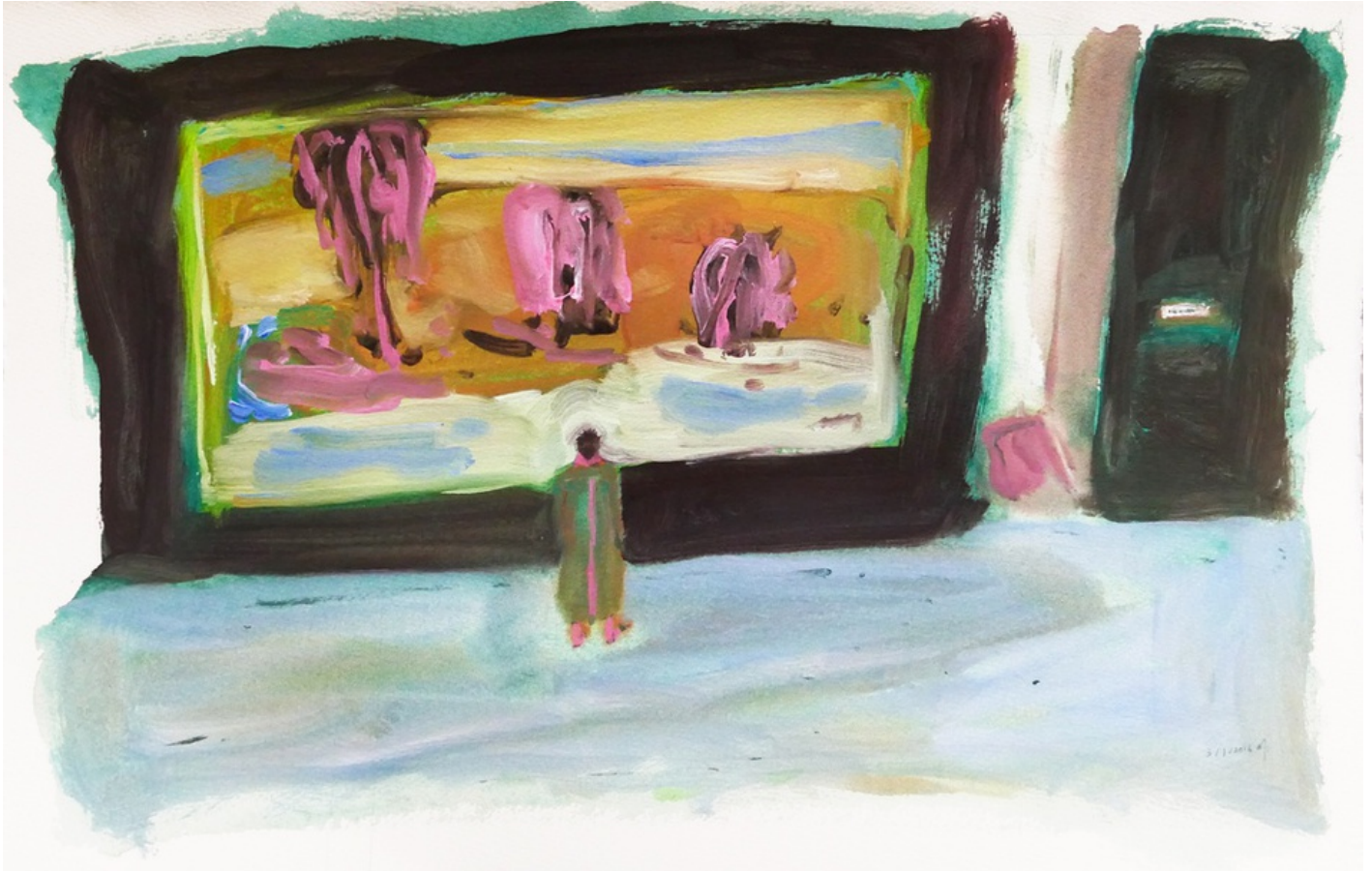
Acrylic on paper 37 x 56 cm, 42 x 60 cm framed

Exhibitions The Imaginary Order_15/1-5/3/2016_Gallery EXIT