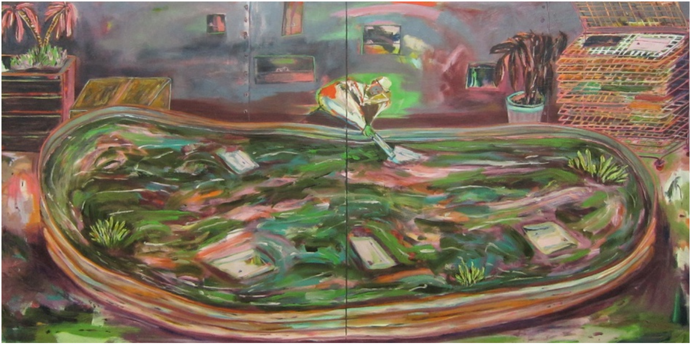
oil on canvas 120 x 240 cm