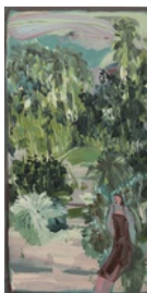
CHENG Ting Ting In Front of the Billboard, 2015 oil on plywood 80 x 40 cm