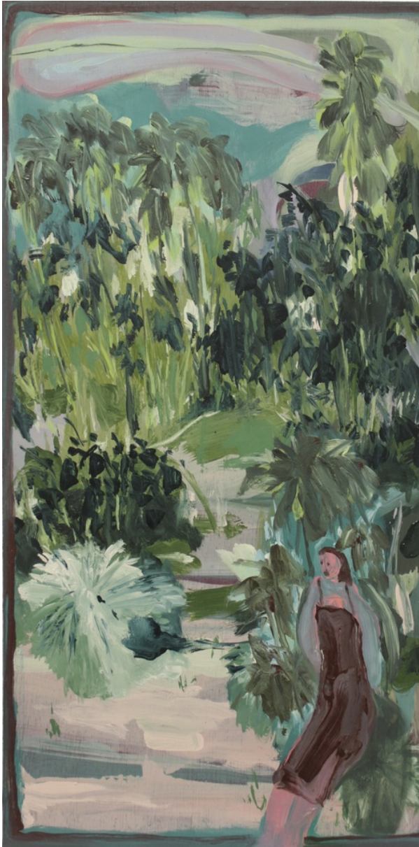
oil on plywood 80 x 40 cm