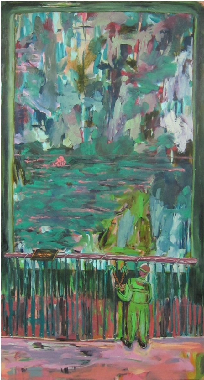
oil on canvas 150 x 80 cm

CHENG TING TING Touring Exhibition of Martha, 2016