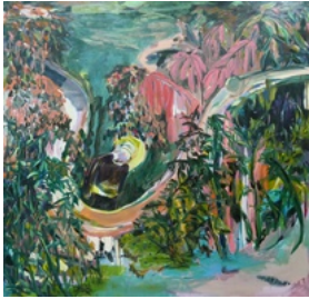
CHENG Ting Ting Along the Lane: Section Q, 2015 oil on canvas 180 x 180 cm