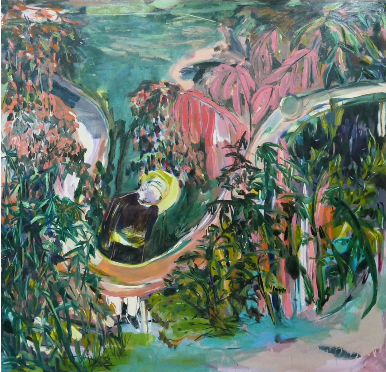
oil on canvas 180 x 180 cm

Exhibitions The Imaginary Order_15/1-5/3/2016_Gallery EXIT